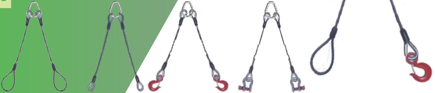
Tabla de longitud de ojos